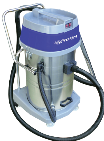
CHROMED STEEL WVC-20